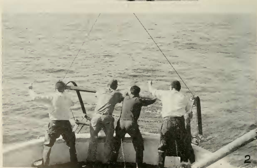
Figure 1. A simple spring balance as used for a strain indicator on the trawl line by Wm. Ripley and associates on the Fish and Game vessel N. B. Scofield .